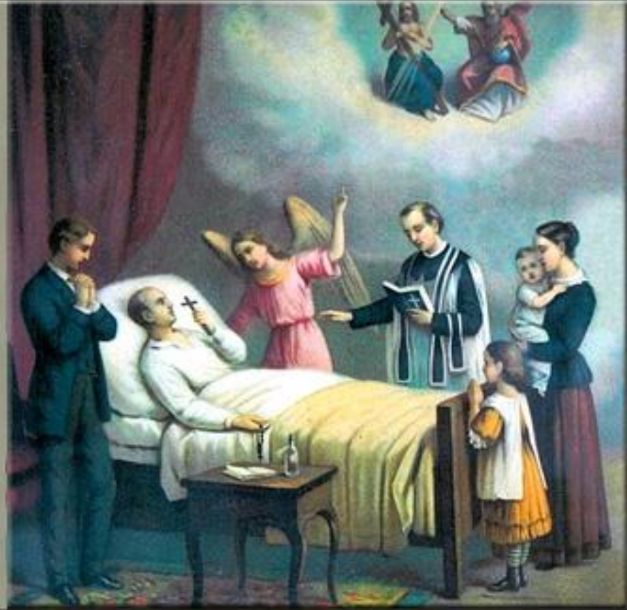
The Death of the Righteous