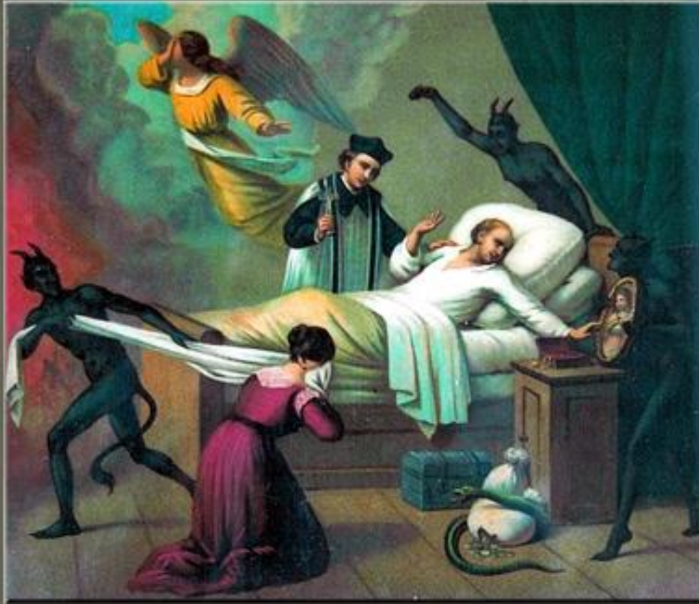
The Death of the Unrepentant Sinner