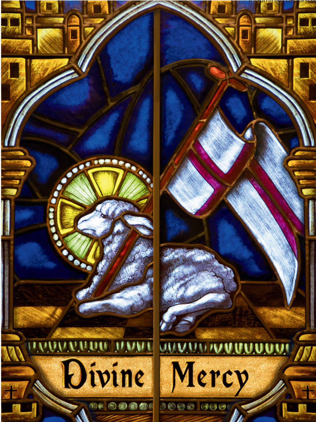
The Lamb of God, Blessed Sacrament Chapel, front right side of the Church

Second Sunday of Easter - Sunday of Divine Mercy II Domingo de Pascua - Domingo de la Misericordia Divina