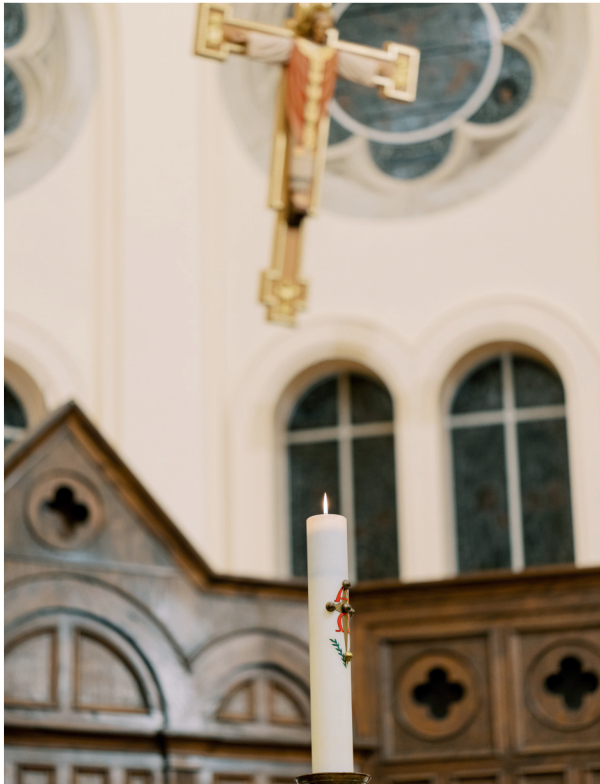
The Paschal candle.