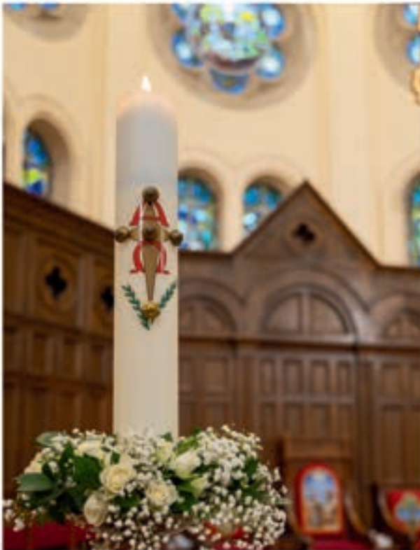
The Paschal candle.