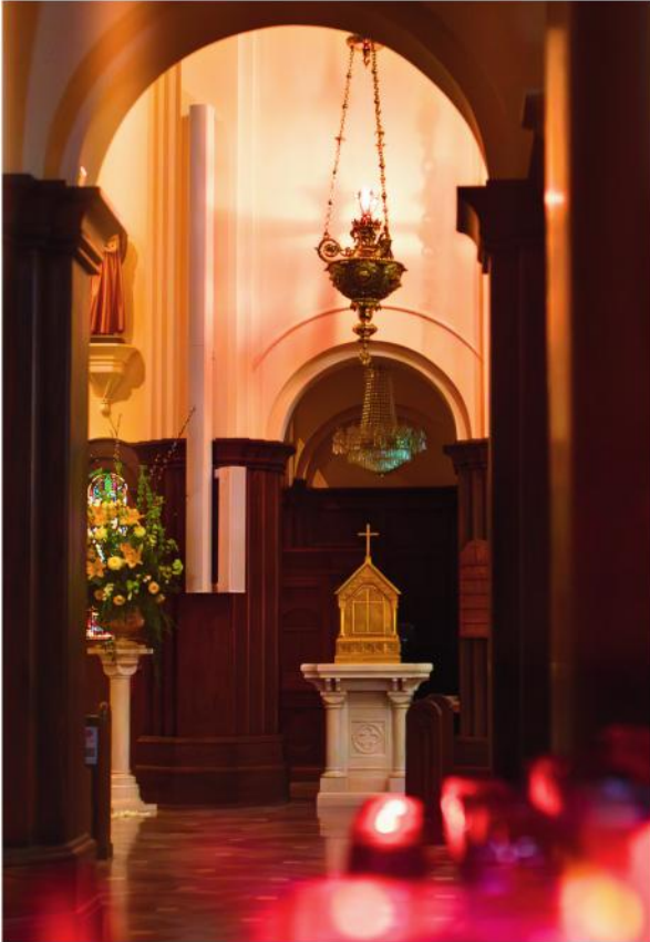
Holy Spirit Catholic Church sanctuary