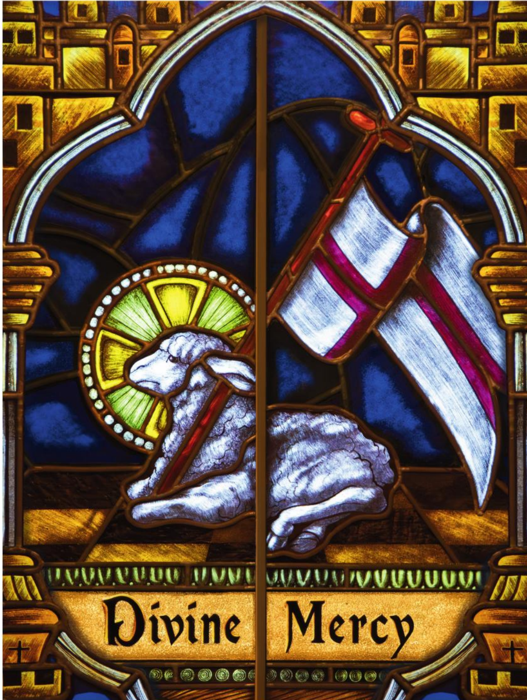
The Lamb of God, Blessed Sacrament Chapel, front right side of the Church

Second Sunday of Easter - Sunday of Divine Mercy II Domingo de Pascua - Domingo de la Misericordia Divina