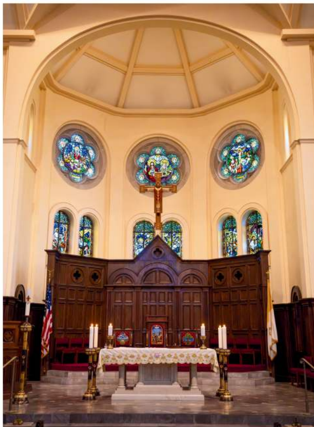
The altar area of the Church.