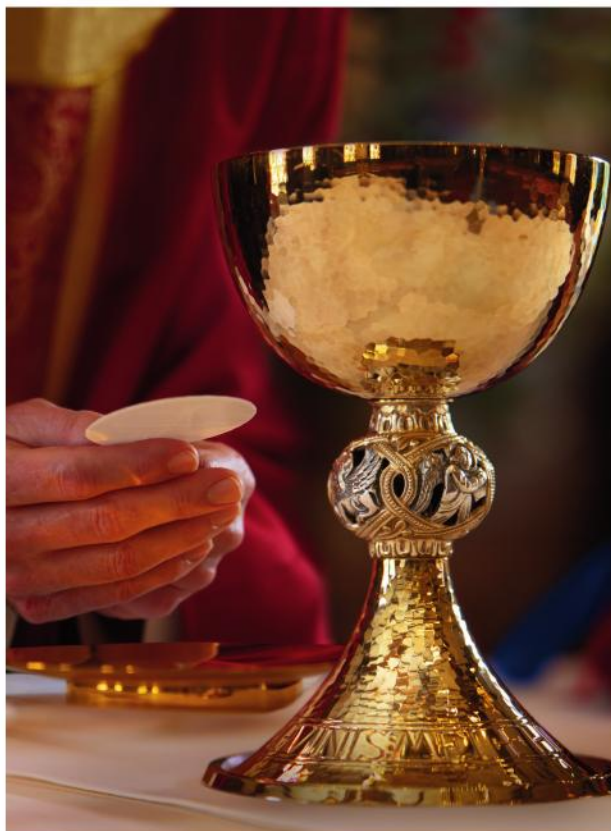
Celebration of Mass, St. Mary's Chapel