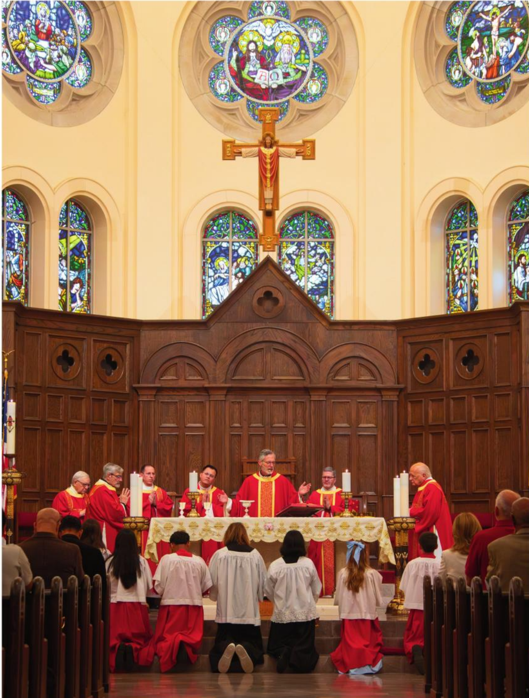
60th Anniversary Mass

Sixteenth Sunday in Ordinary Time XVI Domingo Ordinario