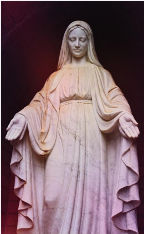
Our Lady of Grace, located below the stairs, main Church entrance.