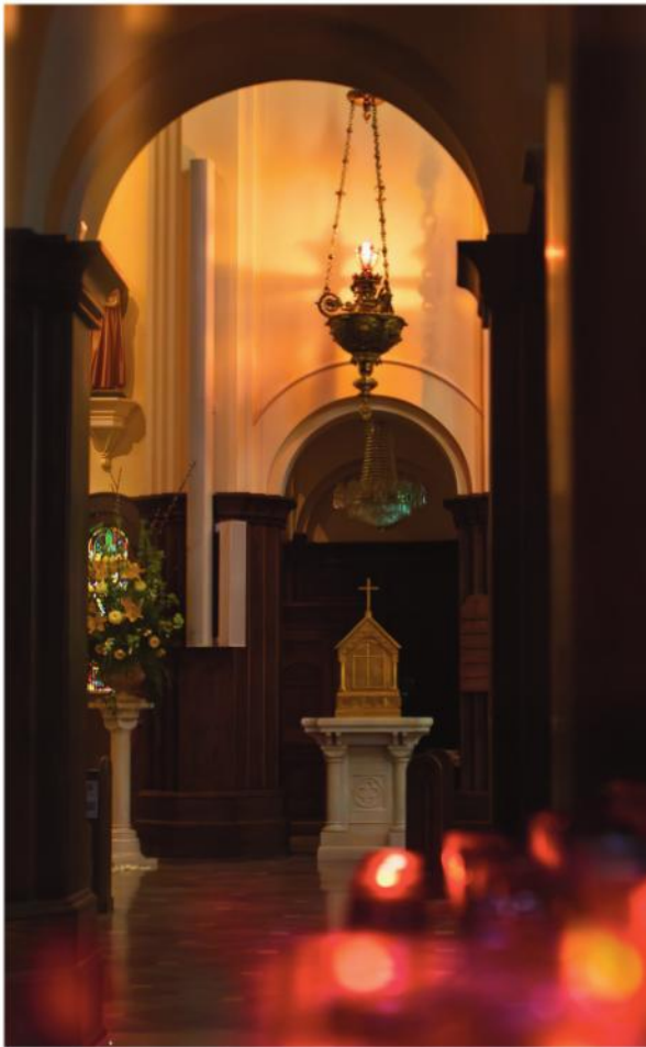
The Tabernacle Chapel as viewed from the side aisle.